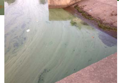
Harmful Algal Blooms (HABs) on Chautauqua and Findley Lakes.